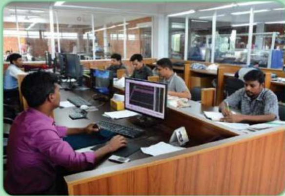
Program & Design