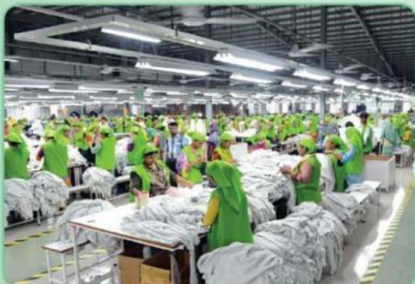
Trimming & Mending